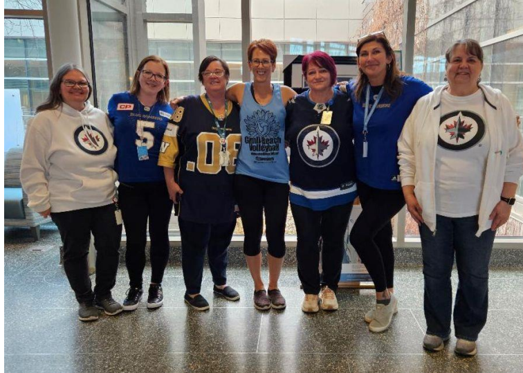
It took teamwork to arrange this photo for Sports Day at Selkirk Regional Health Centre.